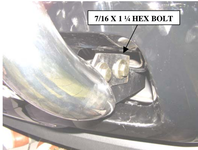
Fig 3 ( Driver Side )