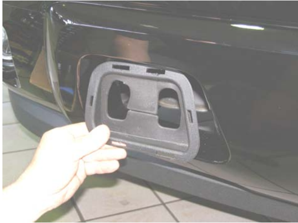
Fig 1 (Passenger Side)

7/16 X 1 1/4" HEX BOLT ( BACK END HOLE )